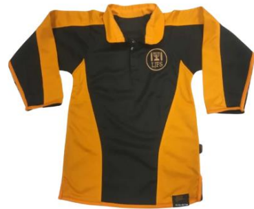
LJFS Rugby Shirt

All logo uniform can be purchased from Rawcliffes, 617-619 Roundhay Road, LS8 4AR, (Tel - 0113 2494025)